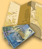
Local maps and some cash in small bills