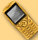
Cell phone with chargers, inverter or solar charger